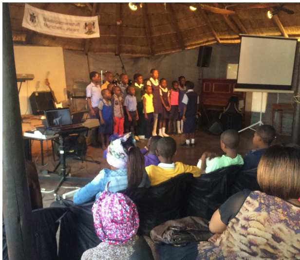
Our children singing a German song at Harare Munich celebration

We have had many visitors this year from all around the world and we helped celebrate the 20 th Anniversary of the Harare/Munich twinning.