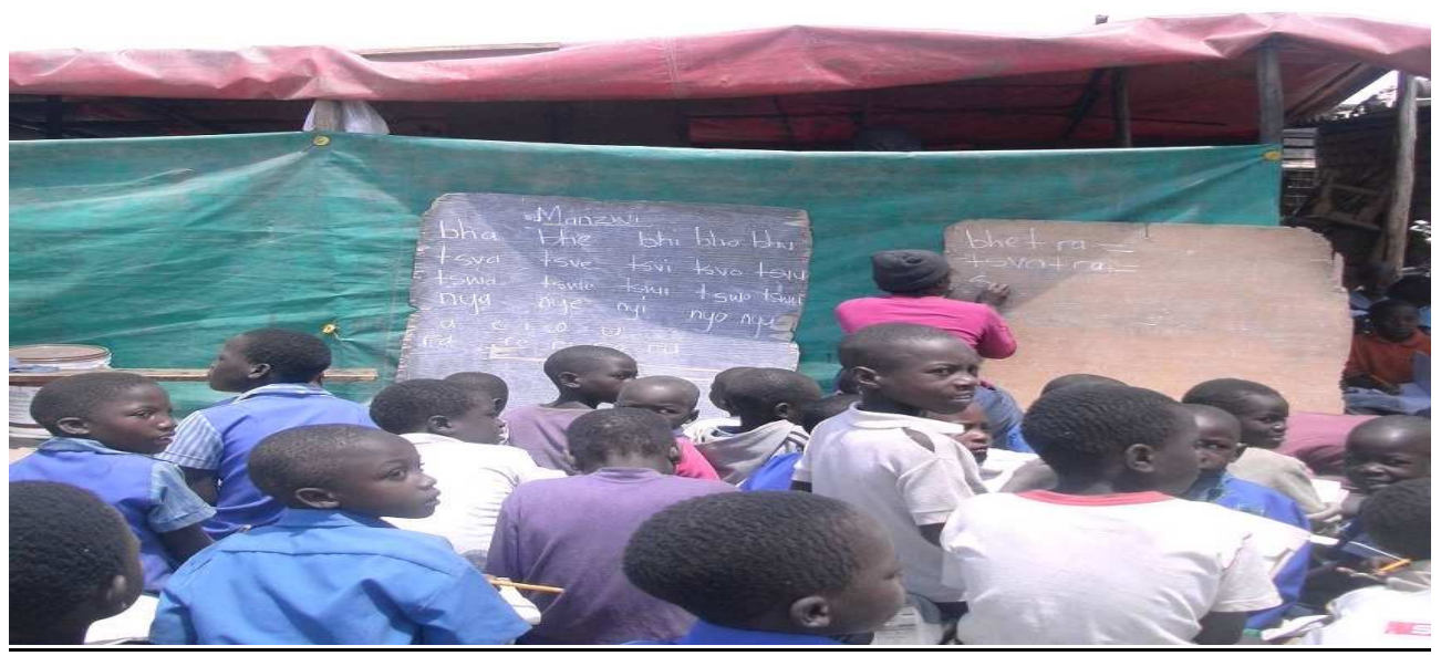
Education is the most powerful weapon that you can use to change the world." (Nelson Mandela)

605 6<sup>th</sup> Floor, Anlaby House Cnr N. Mandela/ Angwa Street Box 7797, Harare. Cell: +263 23 250 738 Fax: +263 4 775 520 c/o ZAN