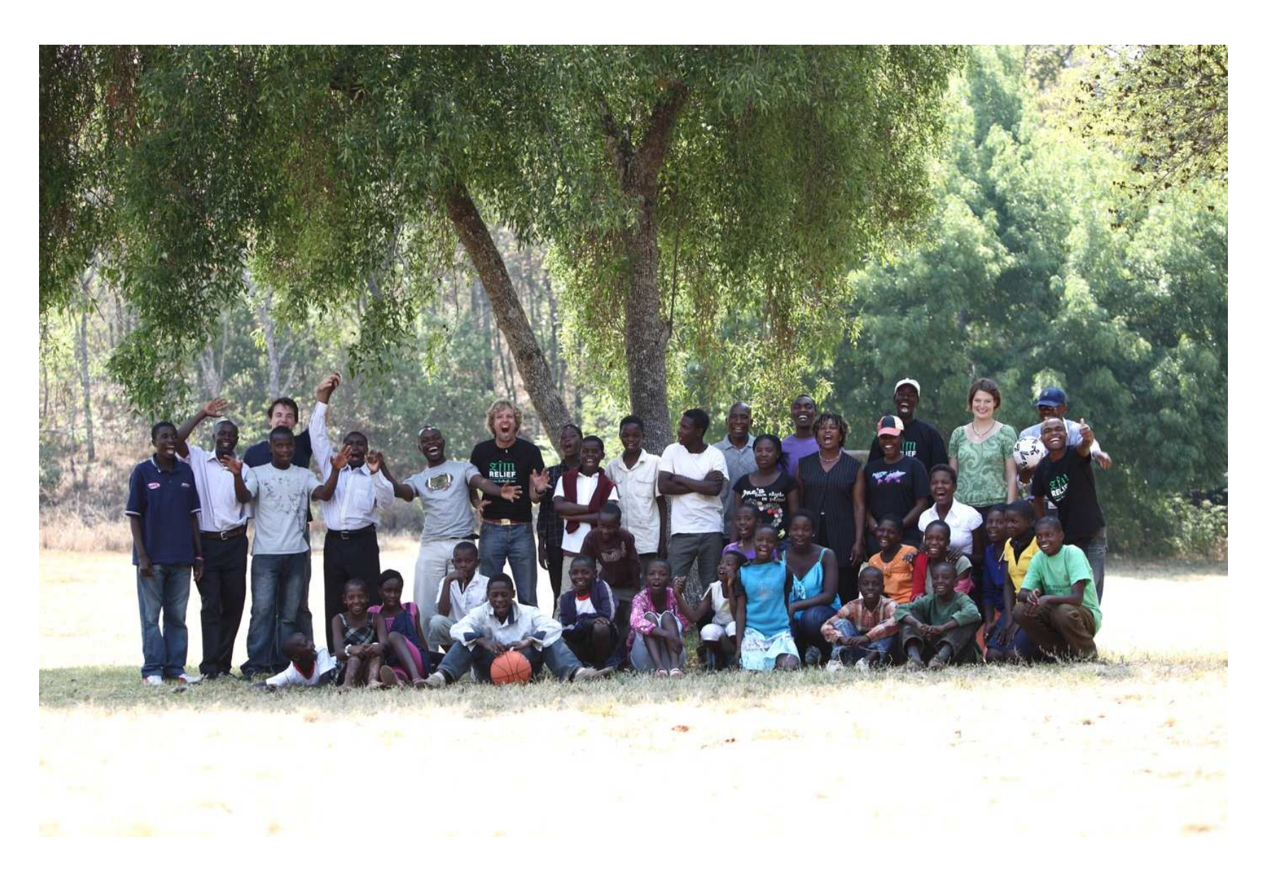
Participants of the Youth Camp