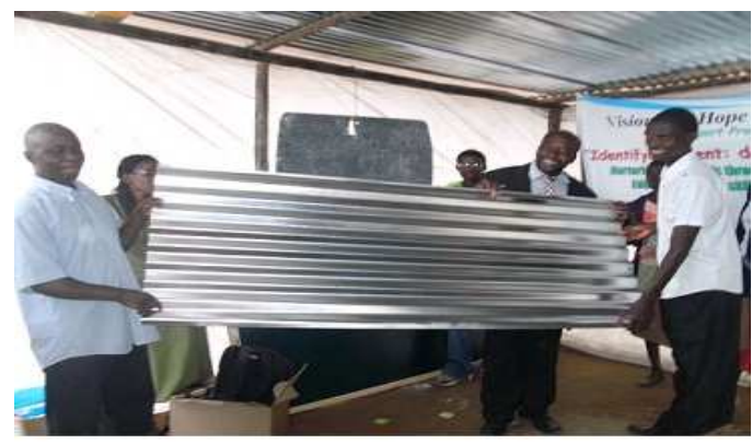
Rising star Head receiving corrugated sheets from Vision and Hope Director

40 children were assisted with school fees in Mbare of which 12 were females. 11 of them were in Secondary school. A total of 100 children from Mbare received stationery in February, May and September 2010. In September 230 from Sunrise primary school in Hopely also received stationery. The stationery received included 10 exercise books, a pencil and a pen each.