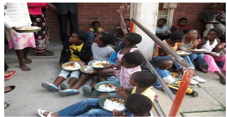
Children feasting at the Christmas party