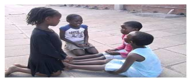
Drama skills sessions