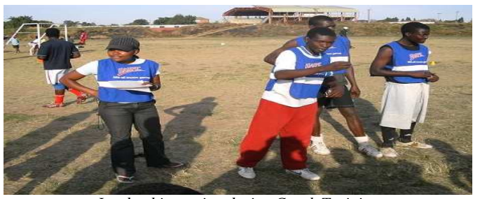
Leadership session during Coach Training