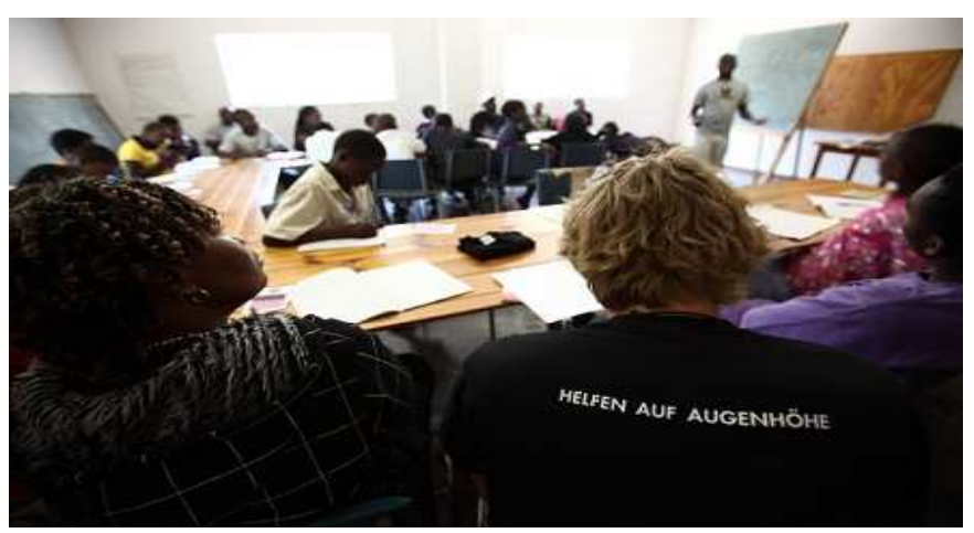
Participants in a session at the youth camp

The topics covered included HIV and AIDS, Nutrition, Bicycle safety, communication, human growth and development, child abuse and child rights. A video on the history of HIV and AIDS in Zimbabwe was screened in the evening. They also enjoyed playing soccer, volleyball and other games.