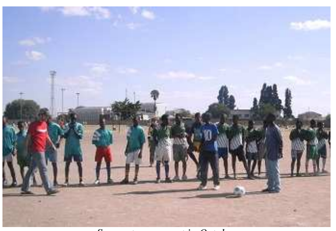
Soccer tournament in October