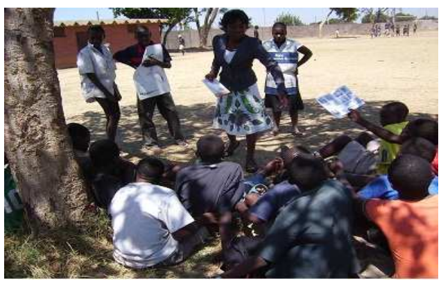
Life skills sessions with teams

EduSport Program has been the outstanding program as it reached more than 2000 young people this year alone. The Program kicked off in April 2009 and its main is to nurture role models through sport, HIV and AIDS education, life skills training and community work. The program has three components that include sporting itself, community work and leadership and life skills development. The program is married to Leadership and Life Skills Development program as many of the trainings related to this program are done under this program.